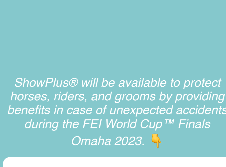
ShowPlus® will be available to protect horses, riders, and grooms by providing benefits in case of unexpected accidents during the FEI World Cup™ Finals Omaha 2023. 🏆