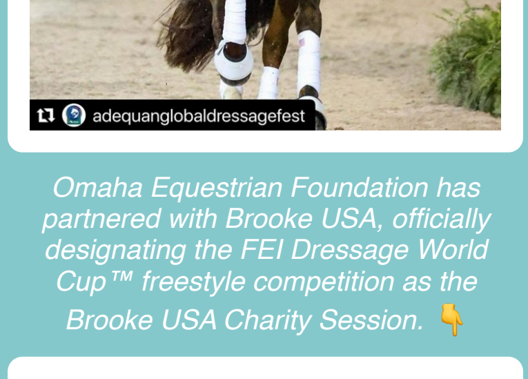
Omaha Equestrian Foundation has partnered with Brooke USA, officially designating the FEI Dressage World Cup™ freestyle competition as the Brooke USA Charity Session. 🏆